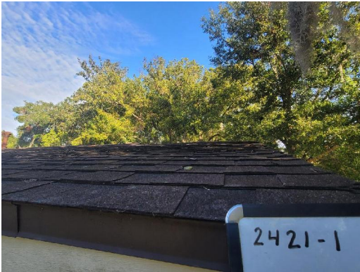
2421-1 Asphalt Shingle Typical Exterior Roof