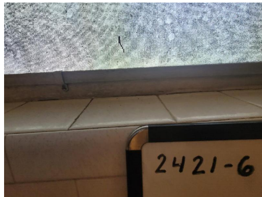
2421-6 Caulk Interior Hall Bathroom Window