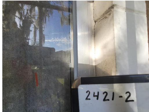
2421-2 Caulk/Tan (3% Chrysotile) Typical Exterior Windows