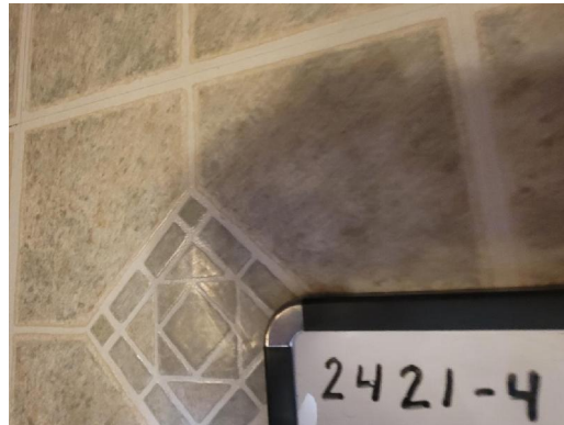
2421-4 12"x12" Floor Tile/Adhesive Interior Bedroom A